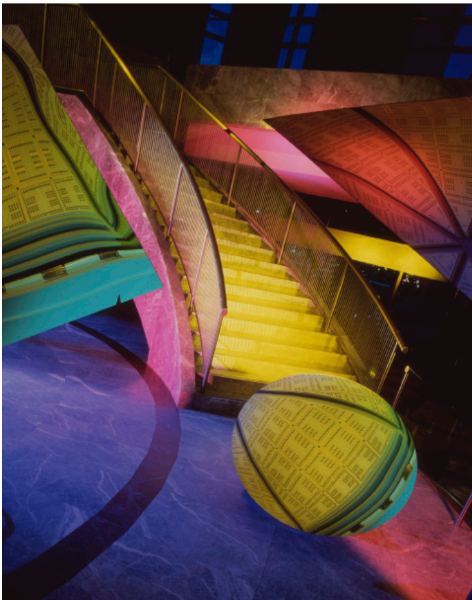
ARCHITECTURAL SITE 7, July 14, 1986, Cibachrome, 60 x 50 inches. Location: World Financial Center, New York, NY. Architect: César Pelli.