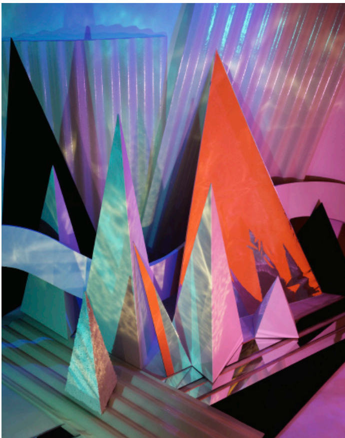
METAPHASE 3, 1986, Cibachrome, 38 x 29 3/4 inches.

their own twist into this medium. We are looking at the essentials and not looking at traditional prescriptions. Now the medium is open for all kinds of experimentation, and that's how you and I are connecting, right?